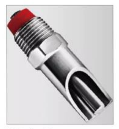
Weight: 83g Diameter: Opposite side22mm Length: 63mm Valve Pole: 8mm Material: SUS 304SST