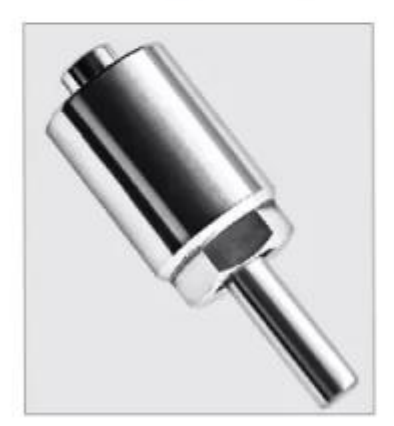
Weight: 100g Diameter: 24mm Length: 60mm Valve Pole: 8mm Material: SUS 304SST