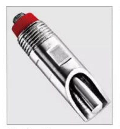
Weight: 80g Diameter: 21mm Length: 63mm Valve Pole: 8mm Material: SUS 304SST