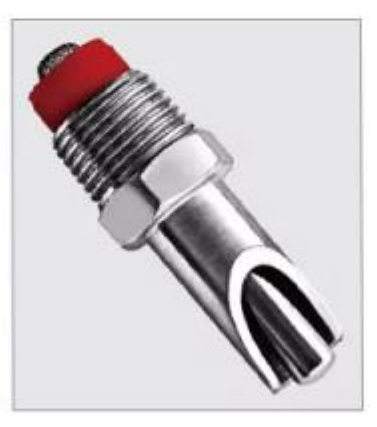
Weight: 70g Diameter: Opposite side22mm Length: 55mm Valve Pole: 8mm Material: SUS 304SST