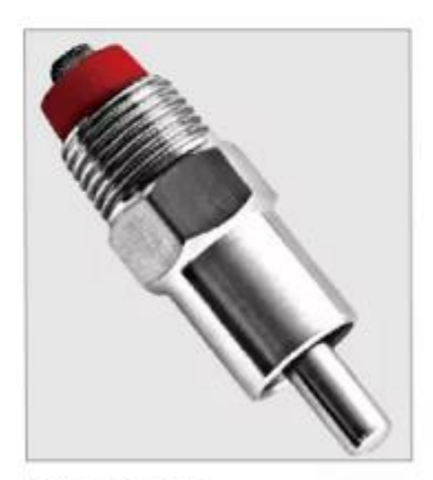
Weight: 65g Diameter: 21mm Length: 55mm Valve Pole: 8mm Material: SUS 304SST