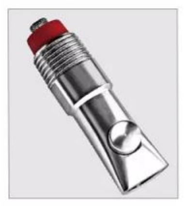
Weight: 79g Diameter: 22mm Length: 63mm Valve Pole: 8mm Material: SUS 304SST