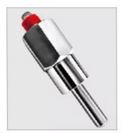
Weight: 118g Diameter: 21mm Length: 80mm Valve Pole: 10mm Material: SUS 304SST