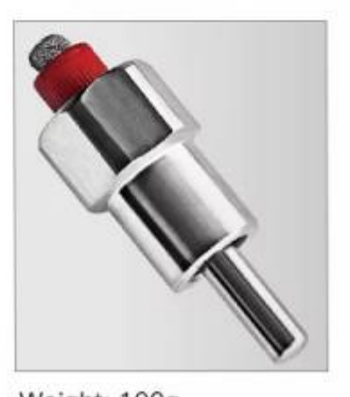
Weight: 100g Diameter: 24mm Length: 60mm Valve Pole: 8mm Material: SUS 304SST